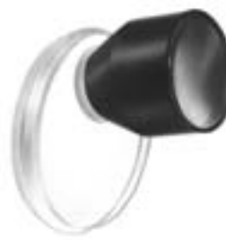
4.0X Bioptic Telescope Model I