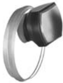
1.7X Bioptic Telescope Model I