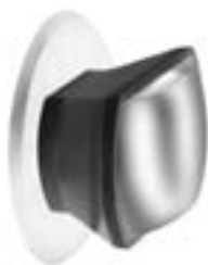
1.7X Wide Angle Bioptic Telescope