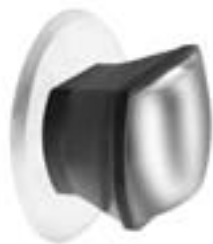
1.4X Wide Angle Bioptic Telescope