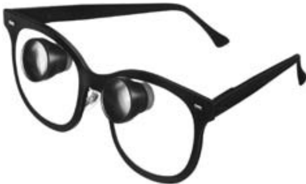
Binocular 3.0X Biopic Telescopes Model I, with black housings, mounted in the Yeoman 6 frame