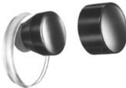
Reading Cap and 3.0X Bioptic Telescope