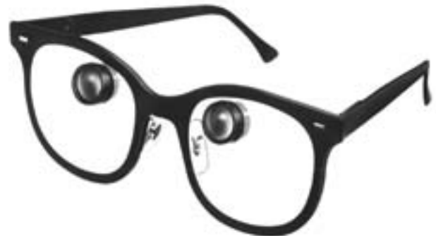
Binocular 2.2X Biopic Telescopes Model II with black housings, mounted in the Yeoman 6 frame