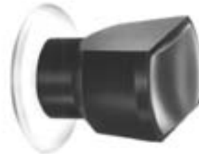
2.2X Wide Angle Bioptic Telescope