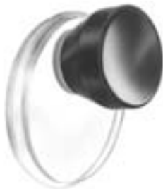
3.0X Bioptic Telescope Model I