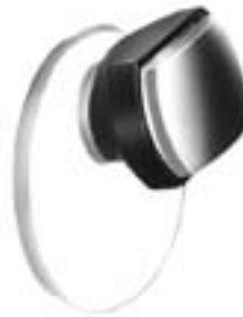
2.2X Bioptic Telescope Model I