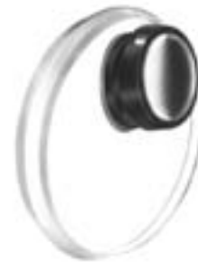
2.2X Bioptic Telescope Model II