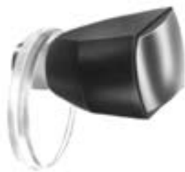
3.0 Wide Angle Bioptic Telescope