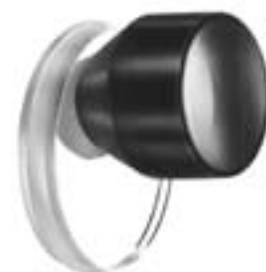
Reading Cap on 3.0X Bioptic Telescope