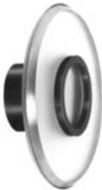
2.2X Eagle Eye Trial Ring