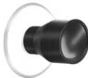
4.0X Full Diameter Telescope