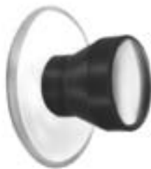
3.0X Full Diameter Telescope