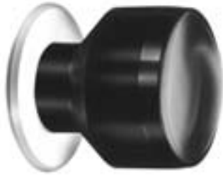
2.2X Wide Angle Full Diameter Telescope