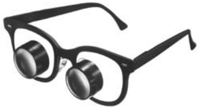
Binocular 2.2X Full Diameter Telescopes with black housings, mounted in the Yeoman 6 frame.