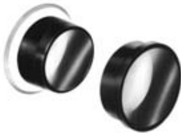
Reading Cap and 2.2X Full Diameter Telescope