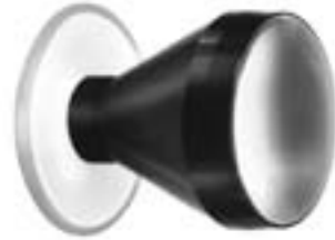
3.0X Wide Angle Full Diameter Telescope