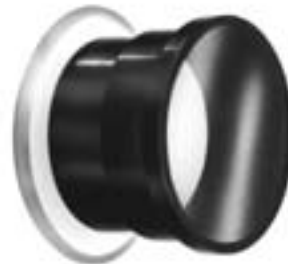
Reading Cap on 2.2X Full Diameter Telescope

The Full Diameter Telescope is mounted centered, and aligned in the straight ahead position