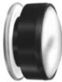
1.7X Full Diameter Telescope