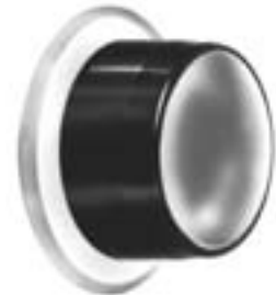
2.2X Full Diameter Telescope