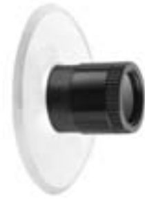
4.0X Politzer Micro Spiral Galilean