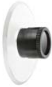
2.2X Politzer Micro Spiral Galilean