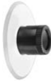
3.3X Politzer Micro Spiral Galilean