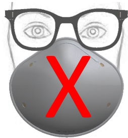
N95 3M 8210

When choosing an N95 mask, use a mask that best accommodates eyewear. The following examples illustrate what to look for in the shape of the mask.