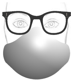
N95 3M 9210/9211