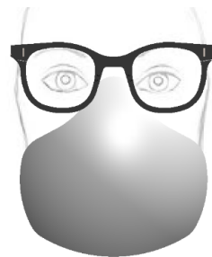
Honeywell ONE-Fit NBW 95V/ Honeywell ONE-Fit N95