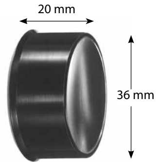
12X Wide Angle Full Diameter Microscope