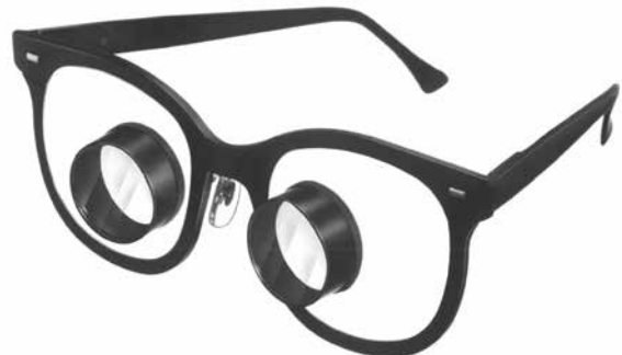
14X Full Diameter Microscope mounted in the Yeoman 6 frame