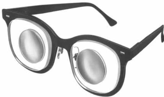
6X Full Diameter Microscope mounted in the Yeoman 6 frame