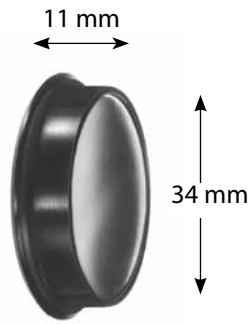
6X Full Diameter Microscope