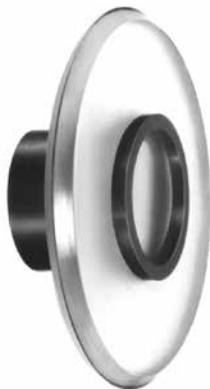
2.2X Eagle Eye Trial Ring