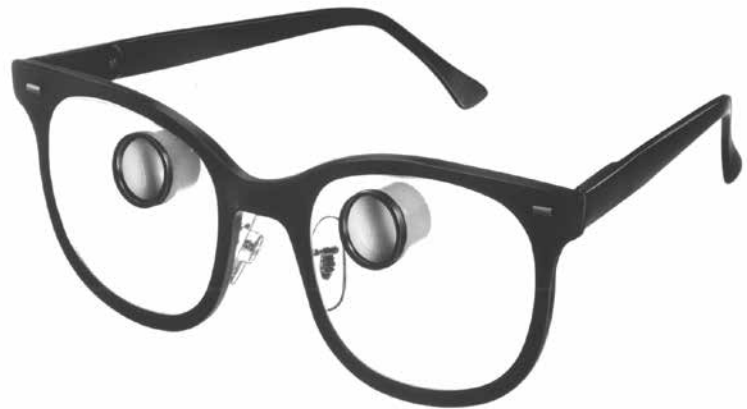
2.2X Eagle Eye II Binocular black housing in Yeoman 6 frame